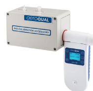
Calibration Kit AS R42