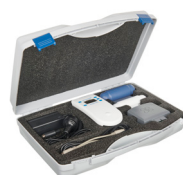
Carry Case Small AS R40