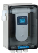
Industrial Enclosure HH ENC