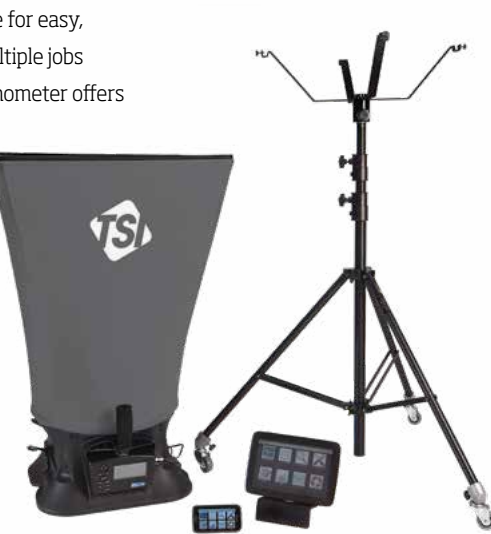
Model 8380 - shown with standard and optional accessories